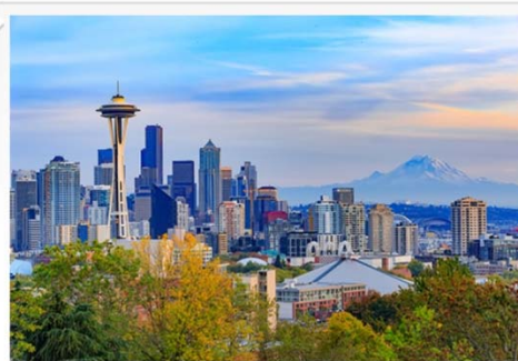
YEA Leadership Weekend

https://www.ashrae.org/membership--conferences/young-engineers-in-ashrae/yea-leadership-weekend